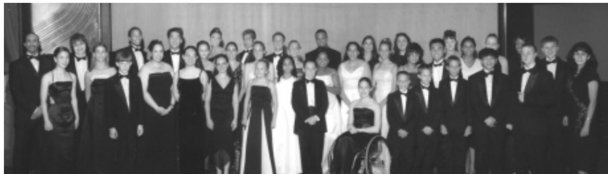
The Nestlé Very Best In Youth 2003 winners joined by the contest sponsors at the black tie awards ceremony in Hollywood, California.